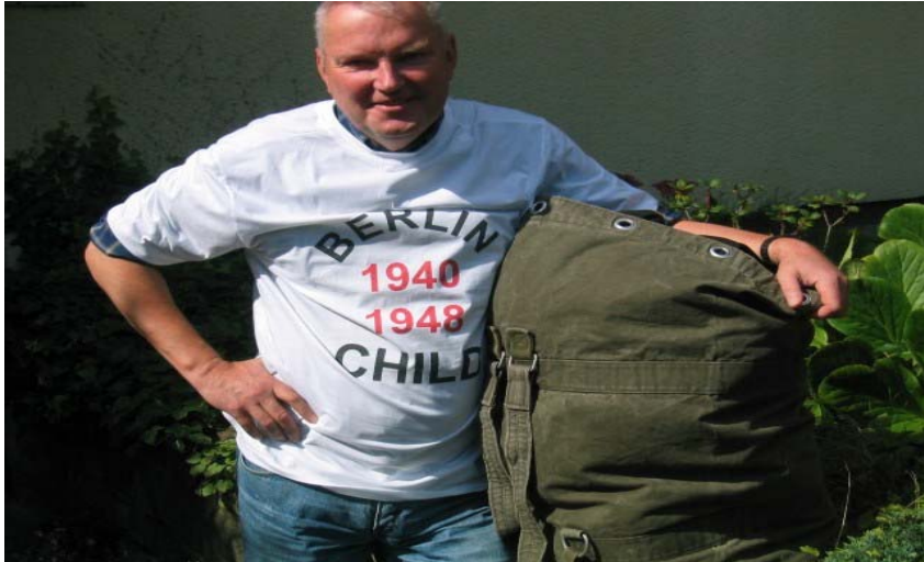
The author: Sleeping bag and pillows are necessary to survive in a truck