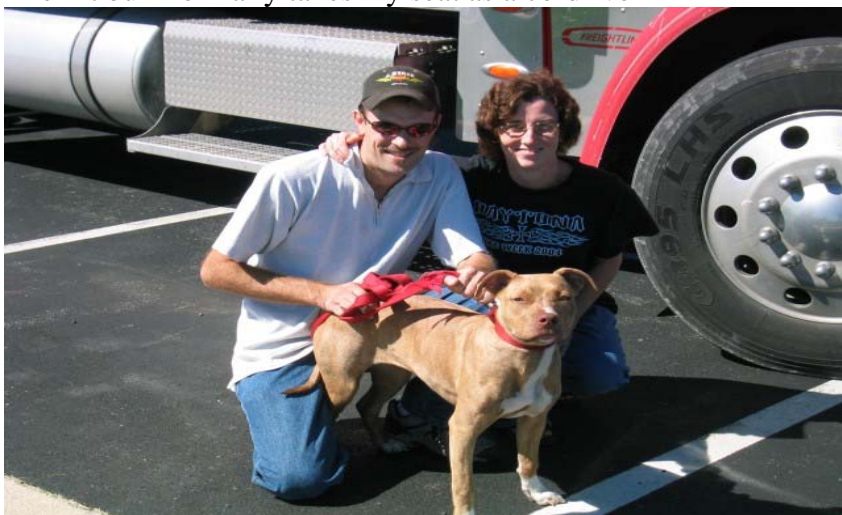
The Pit bull normally takes my seat as a co-driver