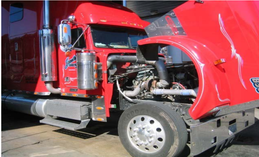
Our 14 litres engine 550 horsepower