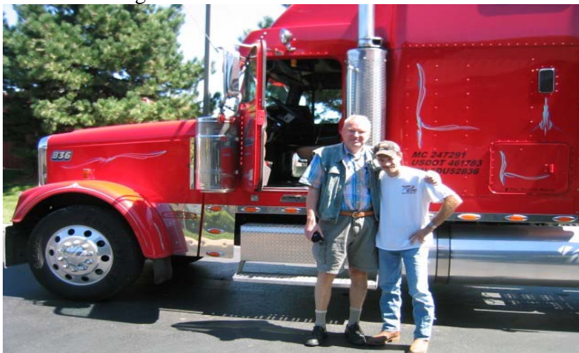
Driver and "co-driver" starting at DHL Wilmington OH. USA