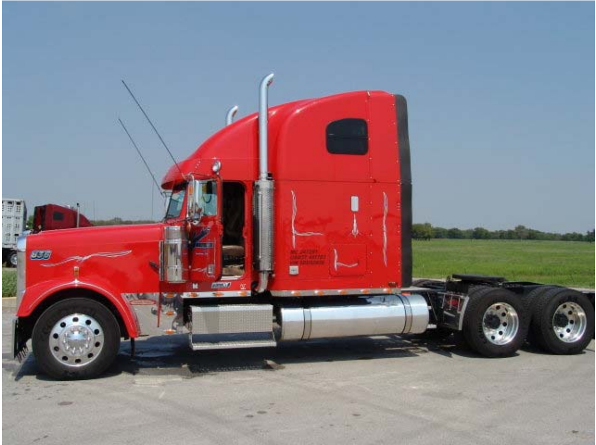
After washing it without the semi trailer it lucks like new