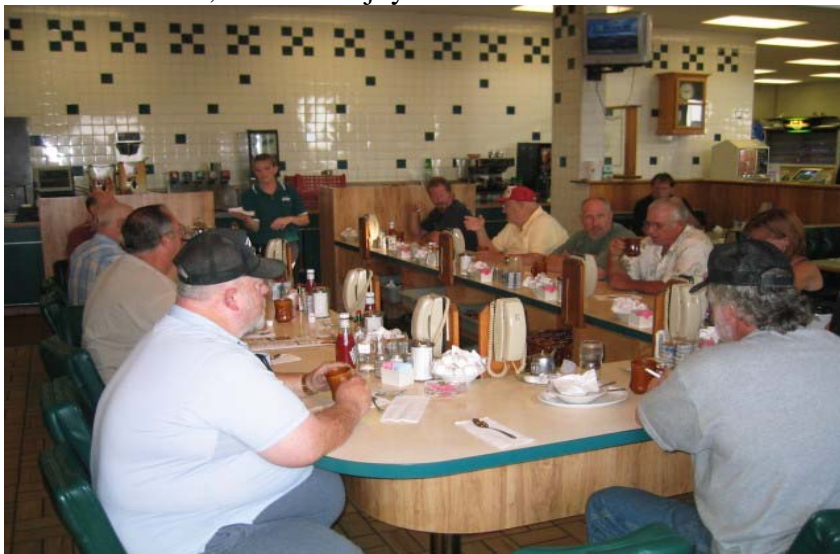
breakfast together in one of the various truck stops.