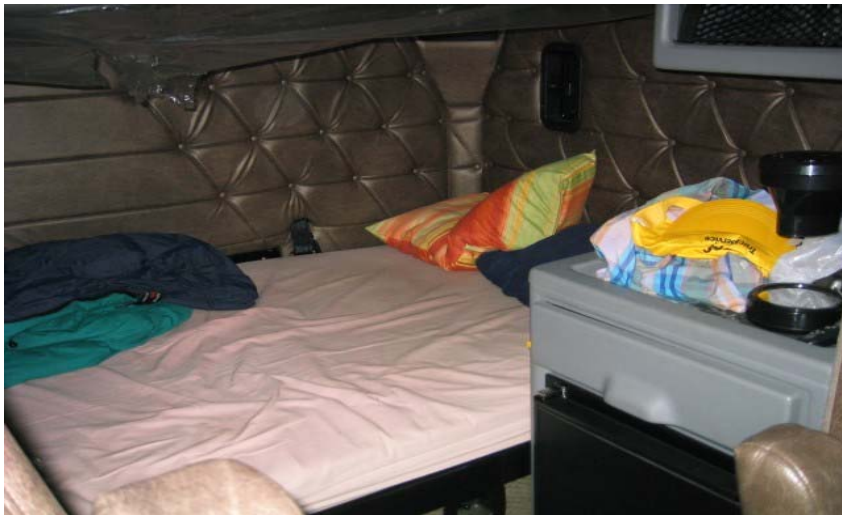
Altogether a very comfortable sleeping place in a US truck