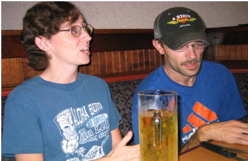
Here with a large beer...